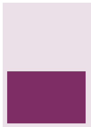
Half page 190mmx130mm